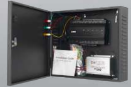
InBio-460 Package B

InBio series is an IP-based biometric access control controller with versatile and flexible functions and it is highly favored in the medium access control management projects with security requirements.